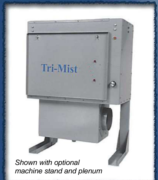
Shown with optional machine stand and plenum